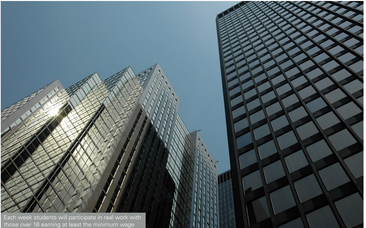
Each week students will participate in real work with those over 16 earning at least the minimum wage