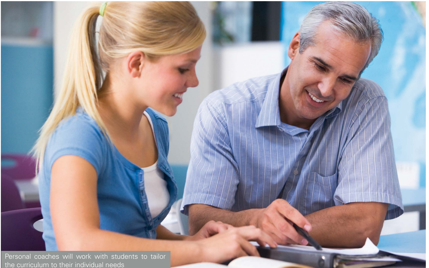
Personal coaches will work with students to tailor the curriculum to their individual needs