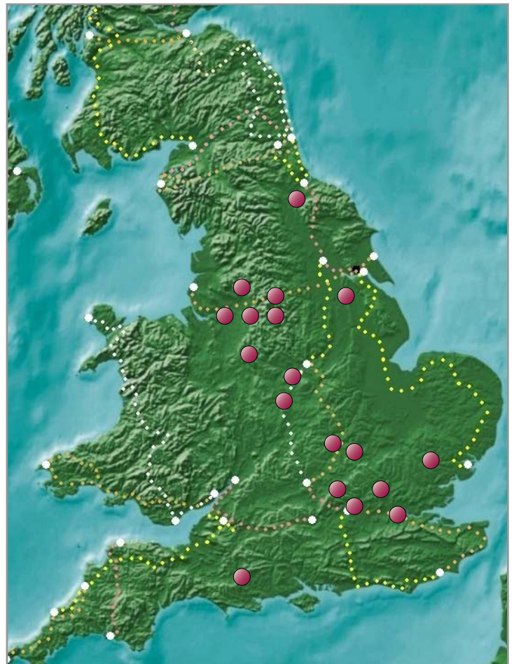
Building momentum. Up and down the country schools, colleges, employers and local authorities have been in touch about establishing Studio Schools in their local area.

The Studio Schools Trust has bold plans for Studio Schools and, working with our local partners, we aim to establish a large network of schools across the country. If you are interested in setting up a Studio School in your local area please contact the Studio Schools Trust via email at enquiries@studioschoolstrust.org or by telephone on 0161 220 3910. For further information about the model and the work of the Trust please visit the Studio Schools Trust website at www.studioschoolstrust.org .